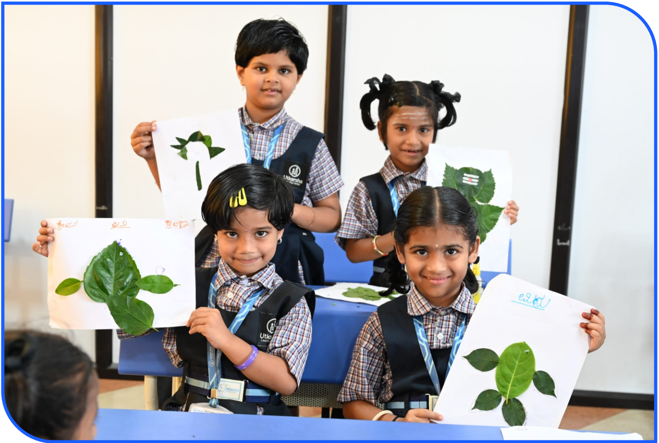
Little artists at Utkarsha School turned leaves into lovely creations, blooming with creativity and confidence