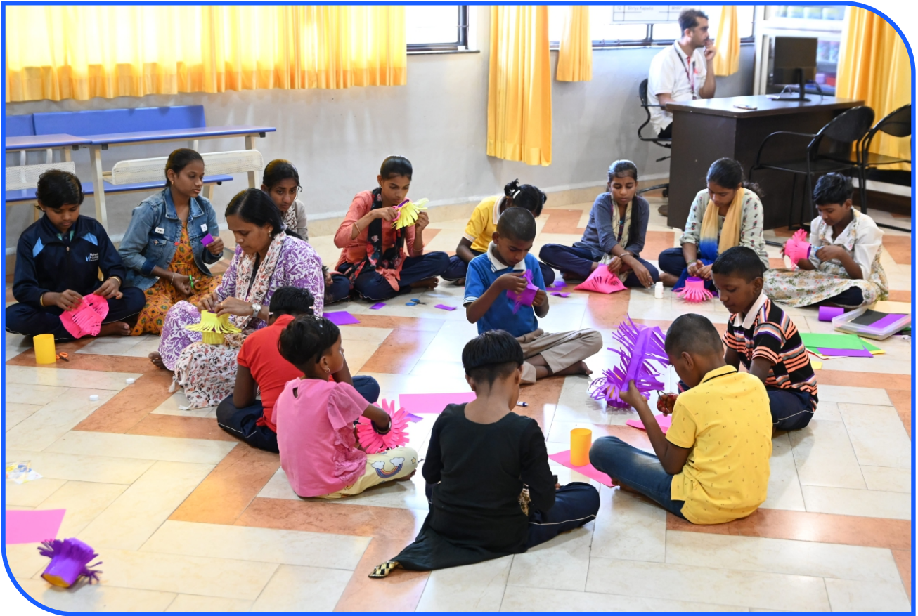
Lantern Making Activity: Lighting up creativity with colors and festive joy.