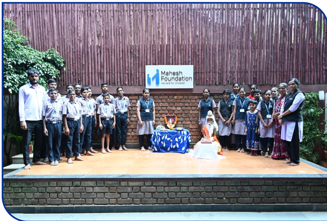
Maharshi Valmiki Jayanti: Celebrating the wisdom and teachings of a great saint-poet.