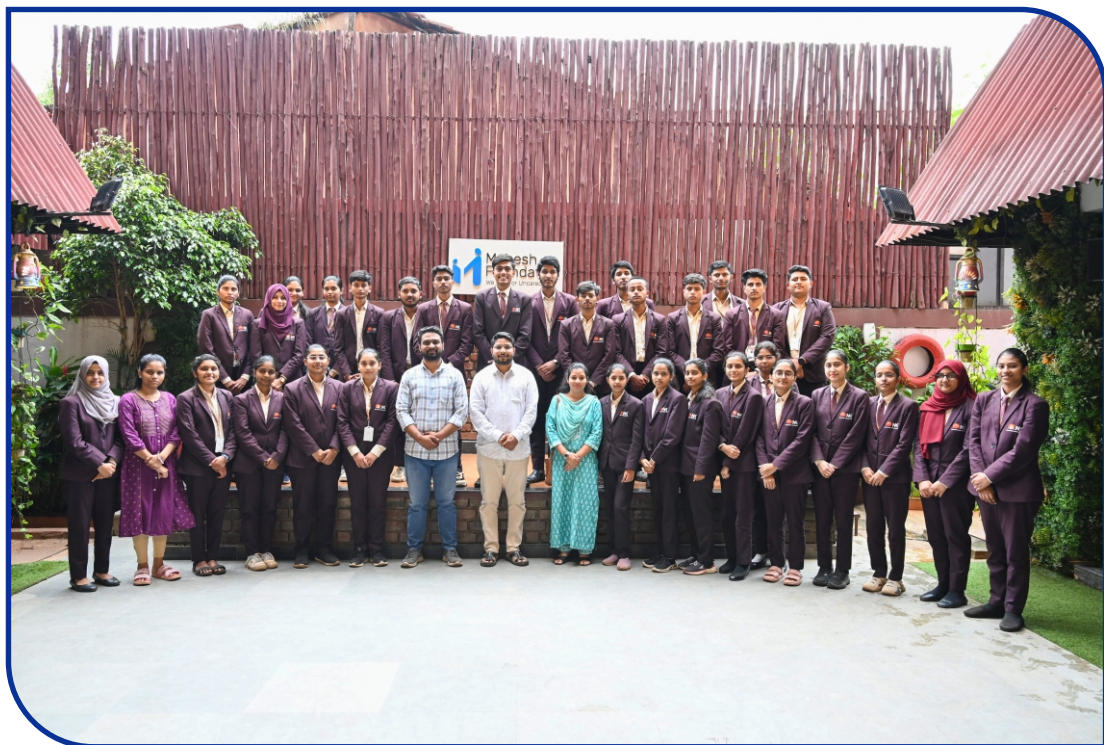
Students from NK Education Foundation College, Belagavi, visit to Mahesh Foundation