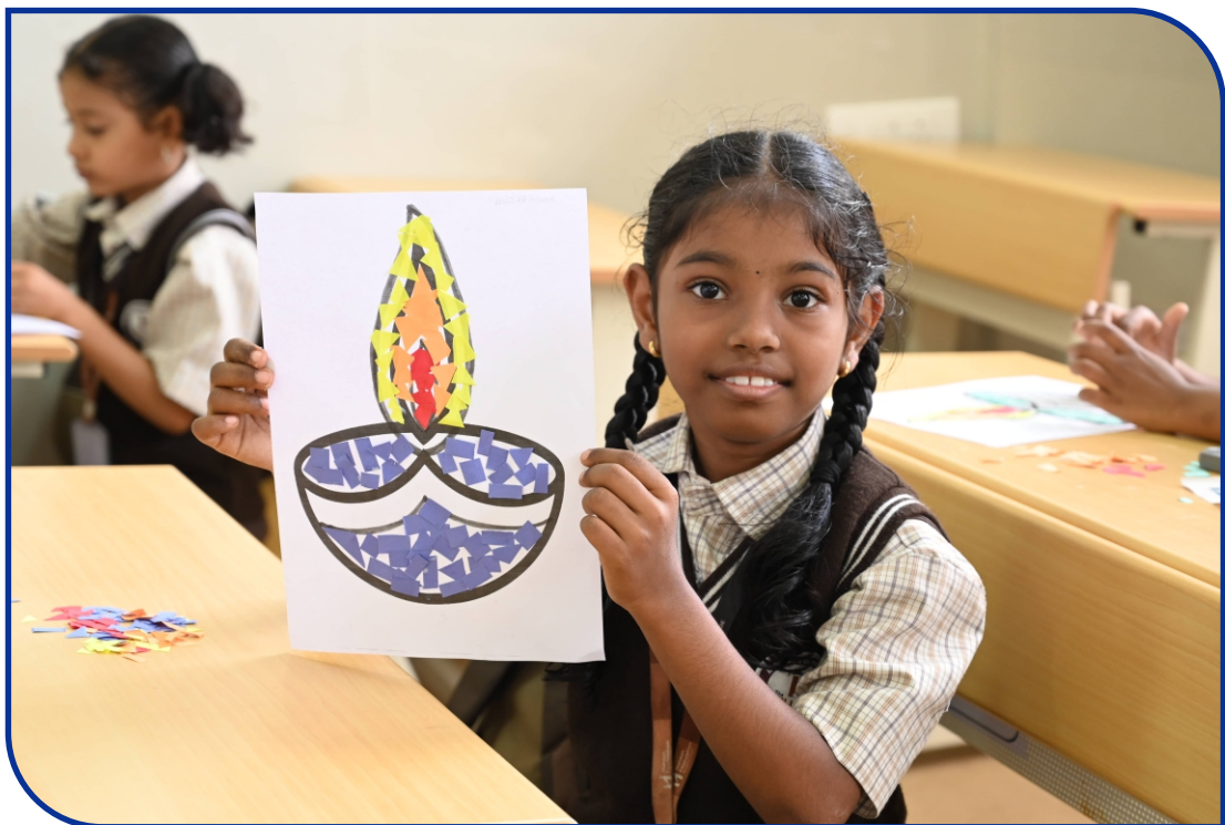
Deepavali preparations by the little ones at The Hillside School