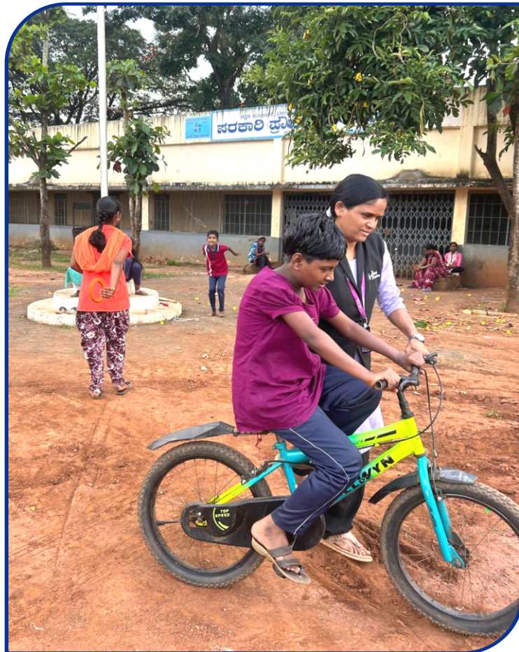
Cycling Training for Girls: Pedaling towards confidence, strength, and independence.