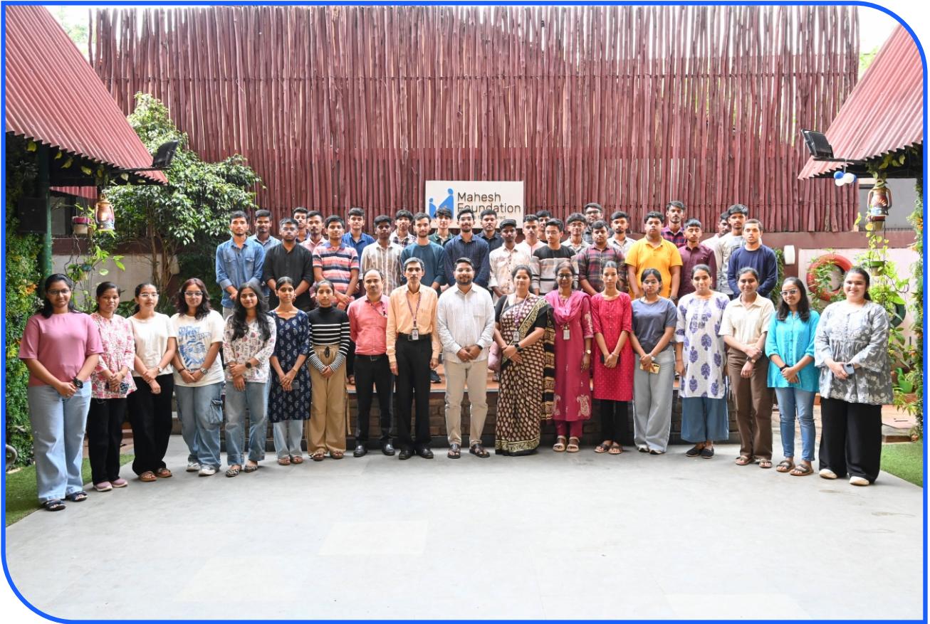
KLS Gogte Institute of Technology (Department of Engineering) students visit to mahesh Foundation