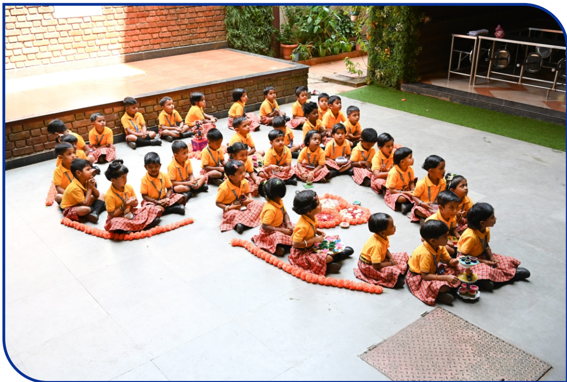
Colourful lanterns making activity by little ones at Utkarsha School