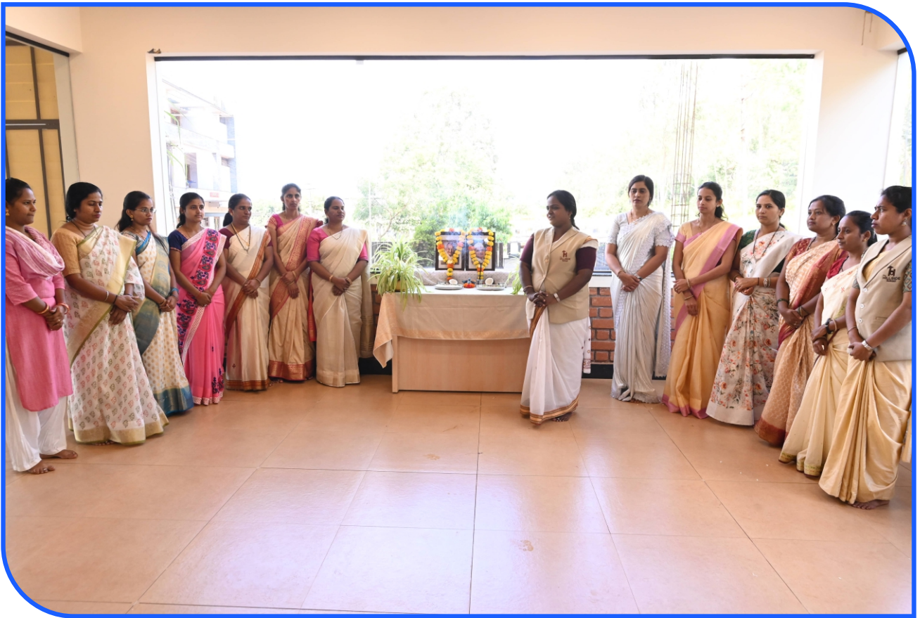
Gandhi Jayanti and Lal Bahadur Shastri Jayanti celebration at The Hillside School