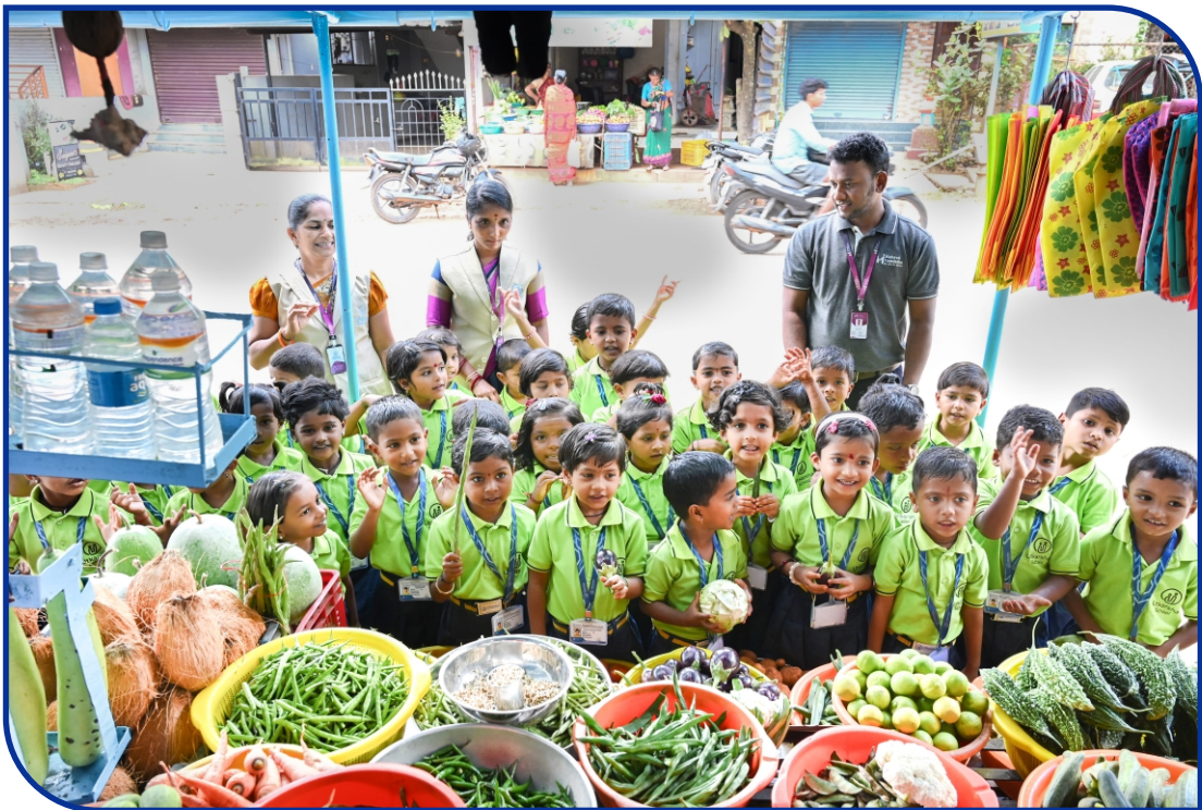
Exploring the Vegetable Market A Fun Learning Experience for Utkarsha Children.