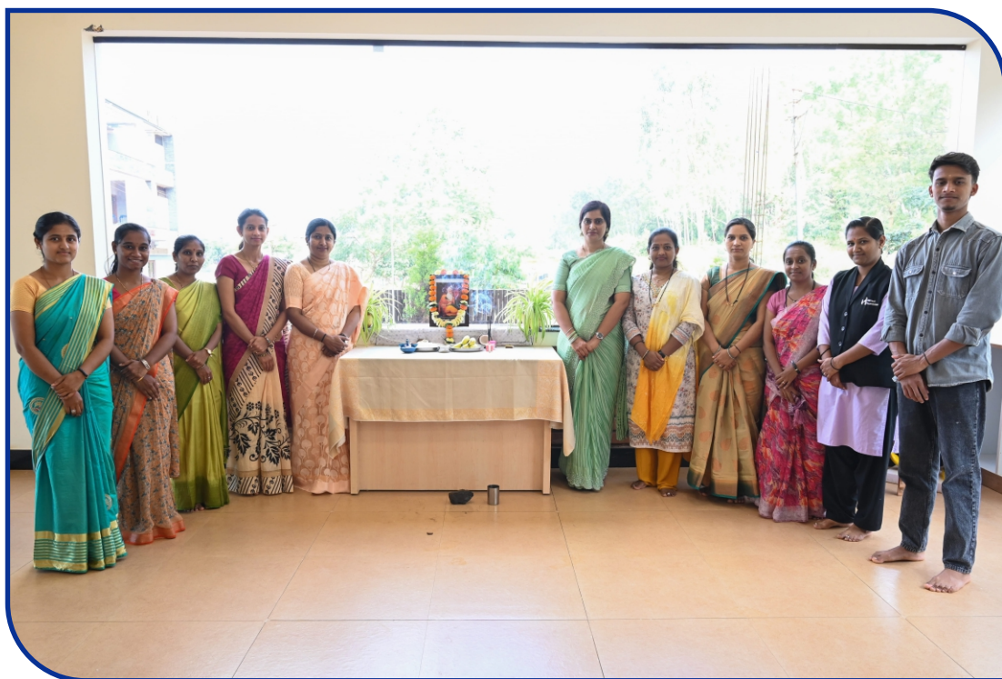
Valmiki Jayanti Celebration at The Hillside School