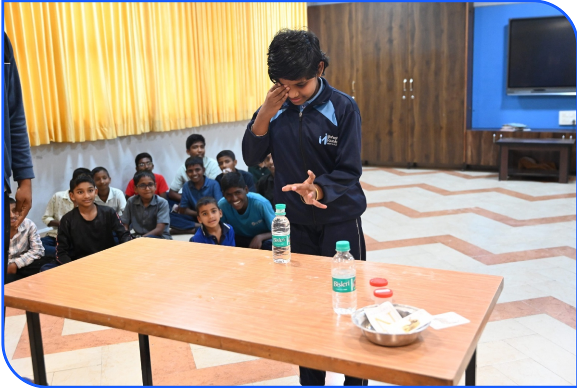
Goal Focusing Activity: Encouraging children to set dreams and work with determination.