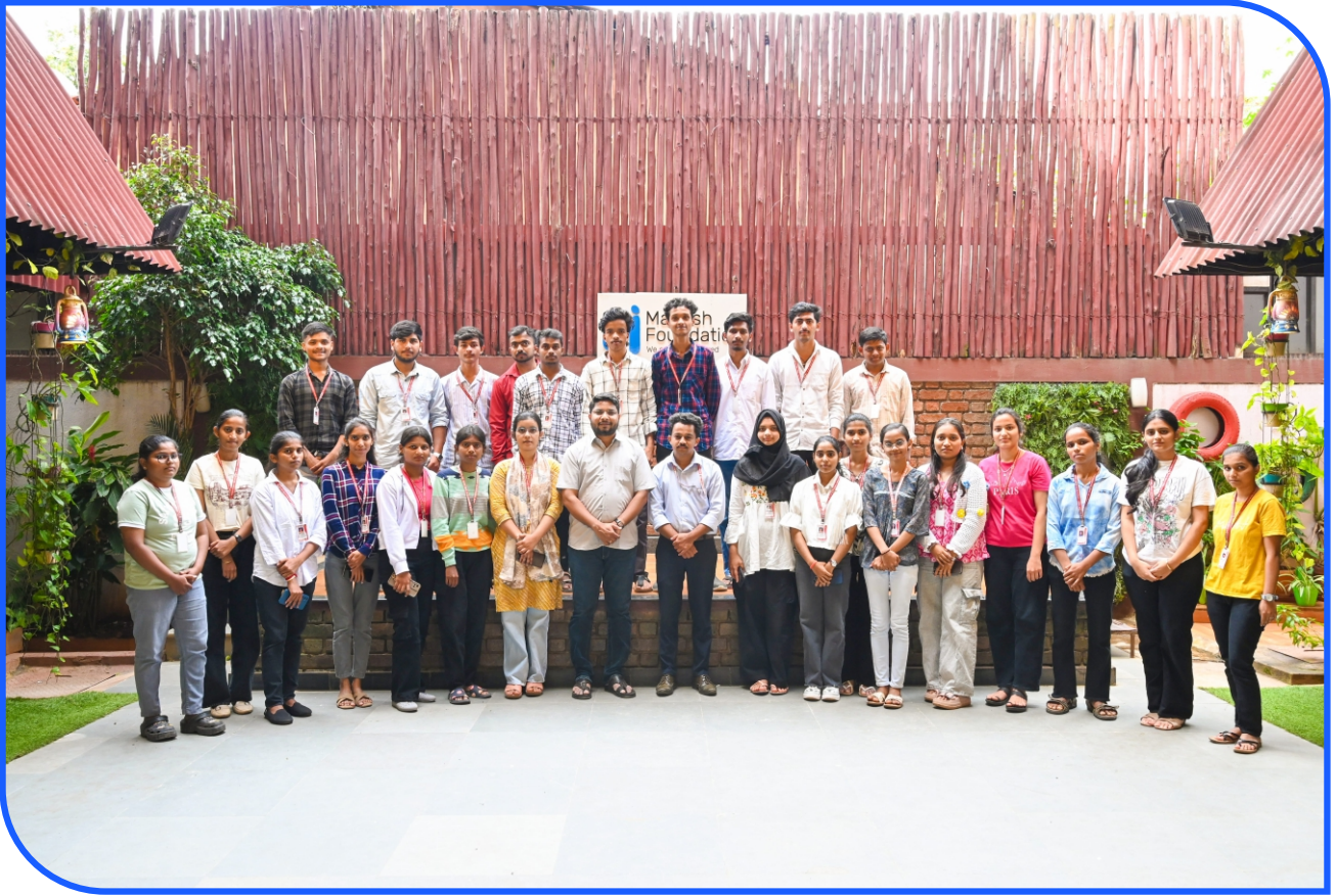
Students from KLE Society's College of BCA, Gokak, visit to Mahesh Foundation