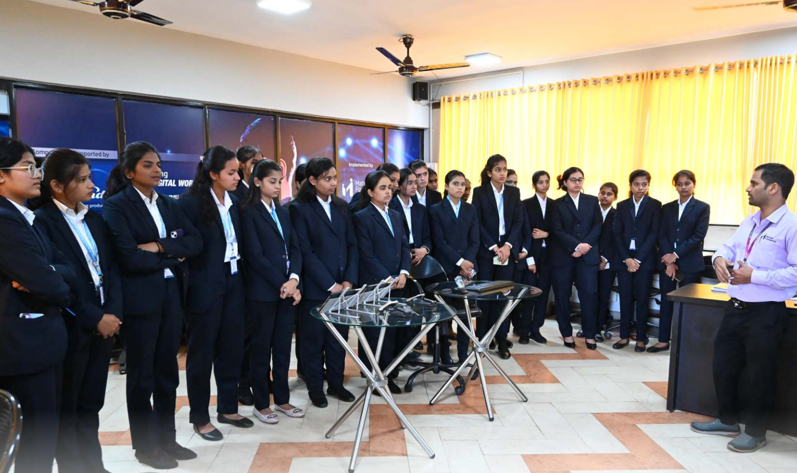
BBA Students from SSS Samithi's College Visit Mahesh Foundation for a Social Responsibility Initiative