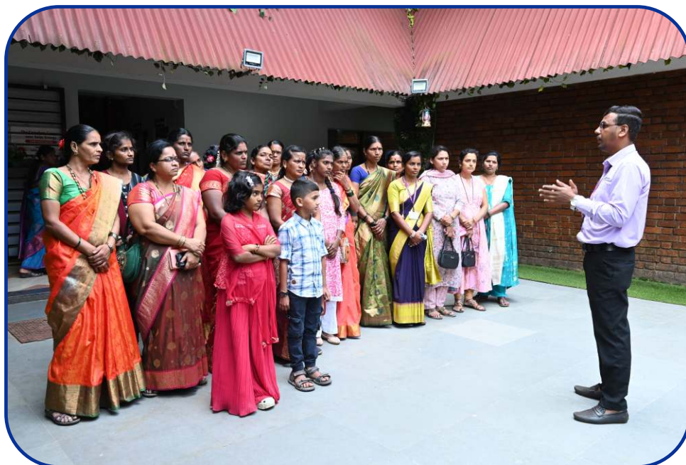
SKDRDP Raibag Members Visit Mahesh Foundation to Explore Women Empowerment Initiatives