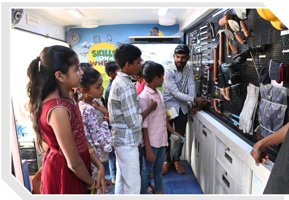
Skill on Wheels Workshop by Pink Samosa Foundation Engages and Empowers Utkarsha School Children.