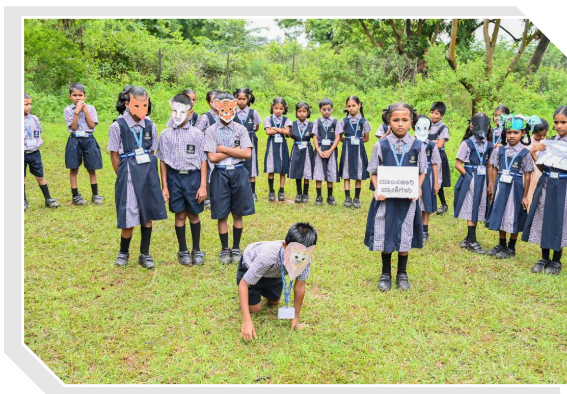
"Totadalli Ondu Dina" Activity Brings the Animal World Alive for Utkarsha School Students