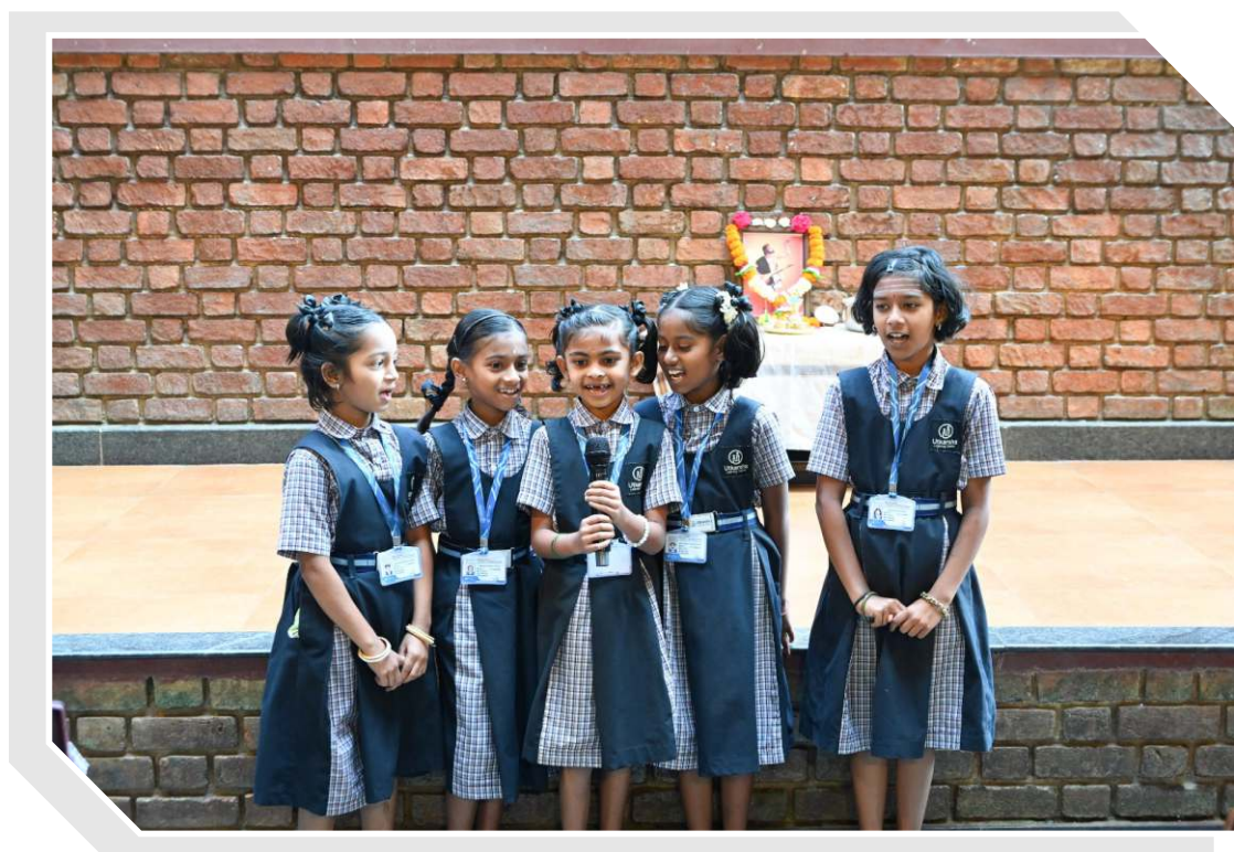
Utkarsha School Celebrates Kanakadasa Jayanti with Devotion and Cultural Pride