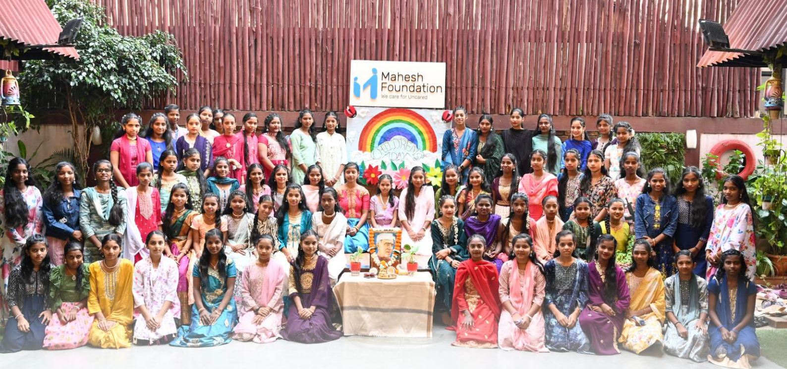
Mahesh Foundation Hosts Dignitaries for Children's Day & World Adoption Month Celebration.