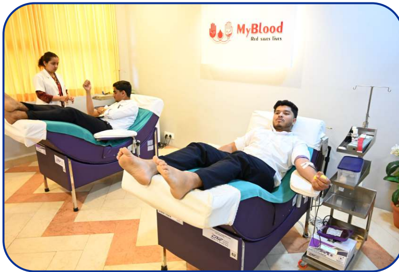
MyBlood Charitable Blood Bank Extends Heartfelt Gratitude to Lifesaving Donors

MyBlood Charitable Blood Bank extends its heartfelt gratitude to all the individuals whose selfless contributions made the camp meaningful and ensured timely support for those in need.