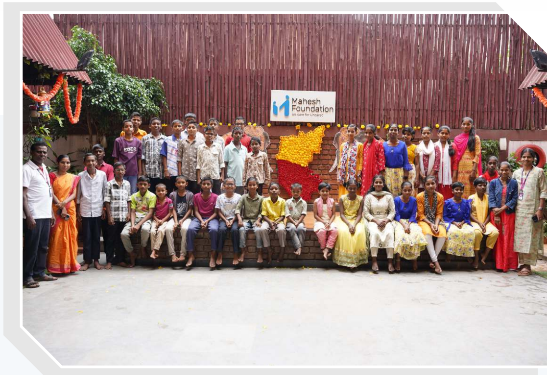
Kannada Rajyotsava Celebration at Ashakiran Care Home.