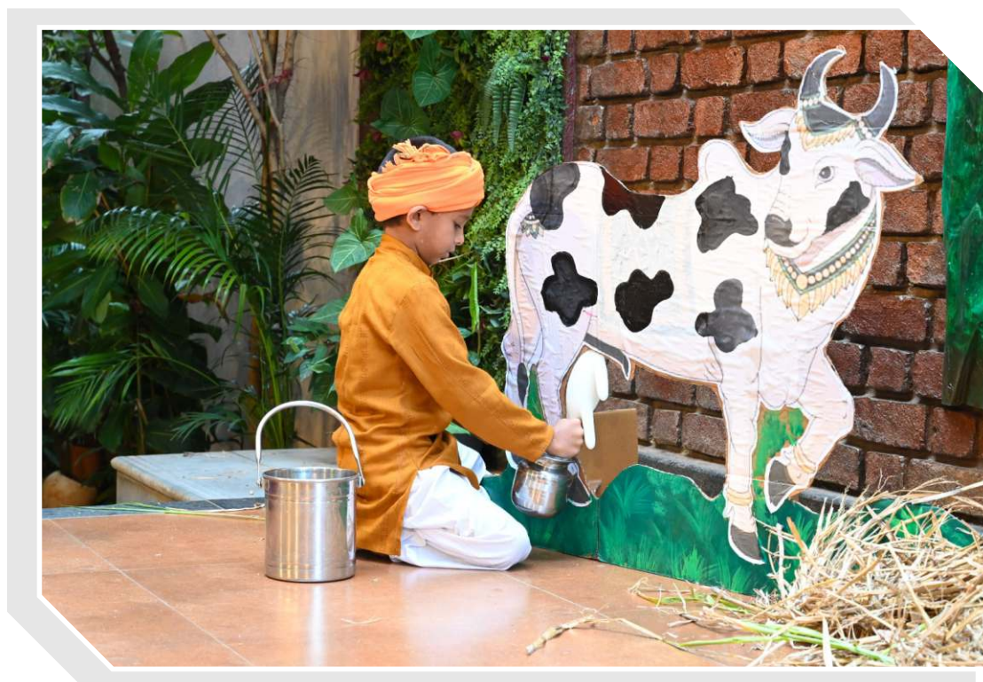
Utkarsha Students Explore Dairy Farming Through a Fun Hands-On Learning Activity