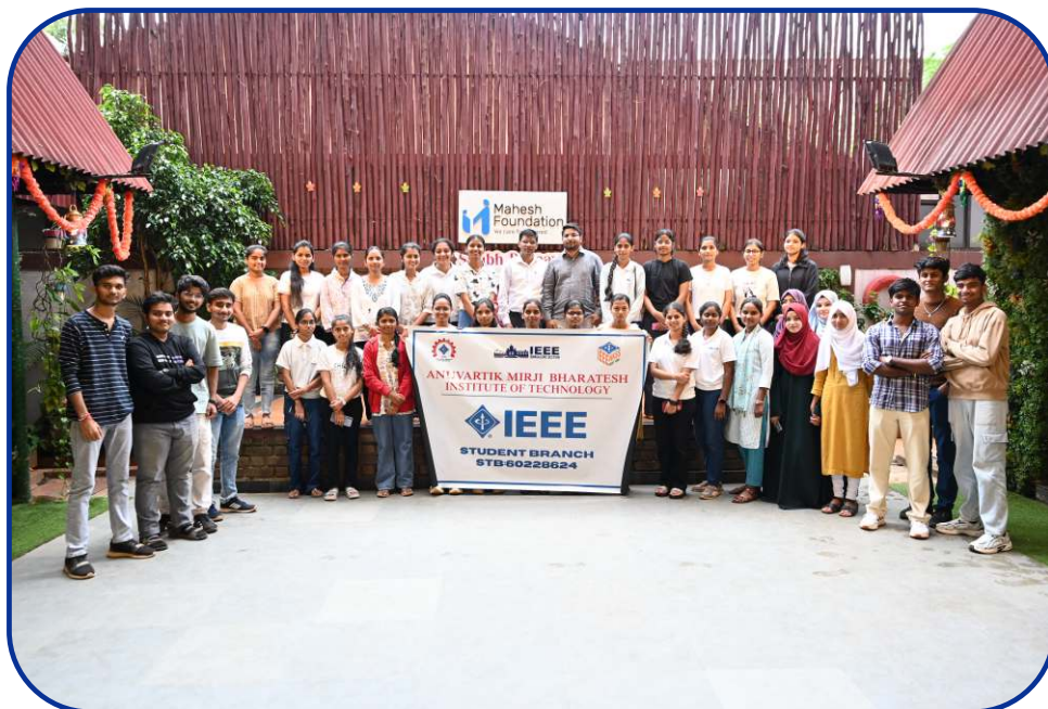
NSS Volunteers from AMBIT Visit Mahesh Foundation for a Social Responsibility Initiative