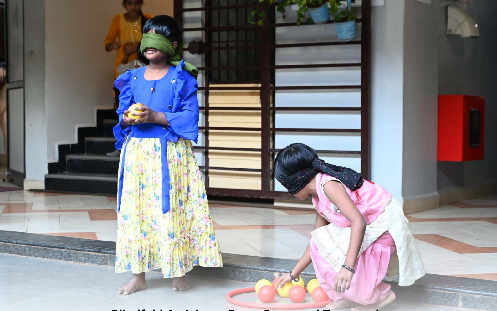
Blindfold Activity to Boost Focus and Teamwork.