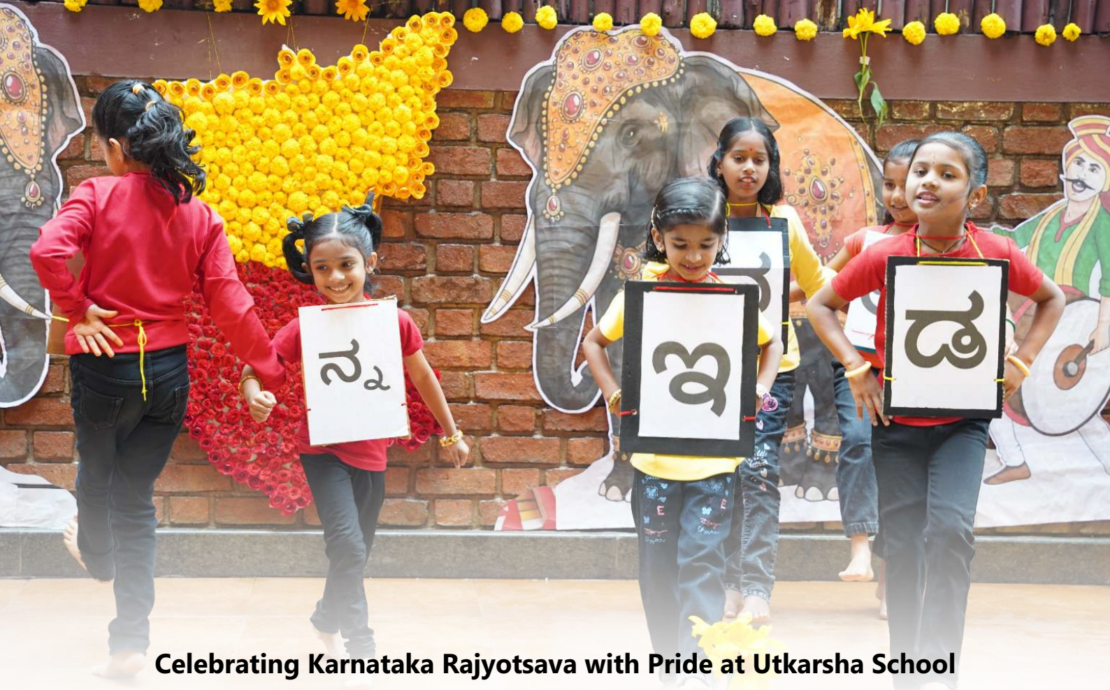
Celebrating Karnataka Rajyotsava with Pride at Utkarsha School