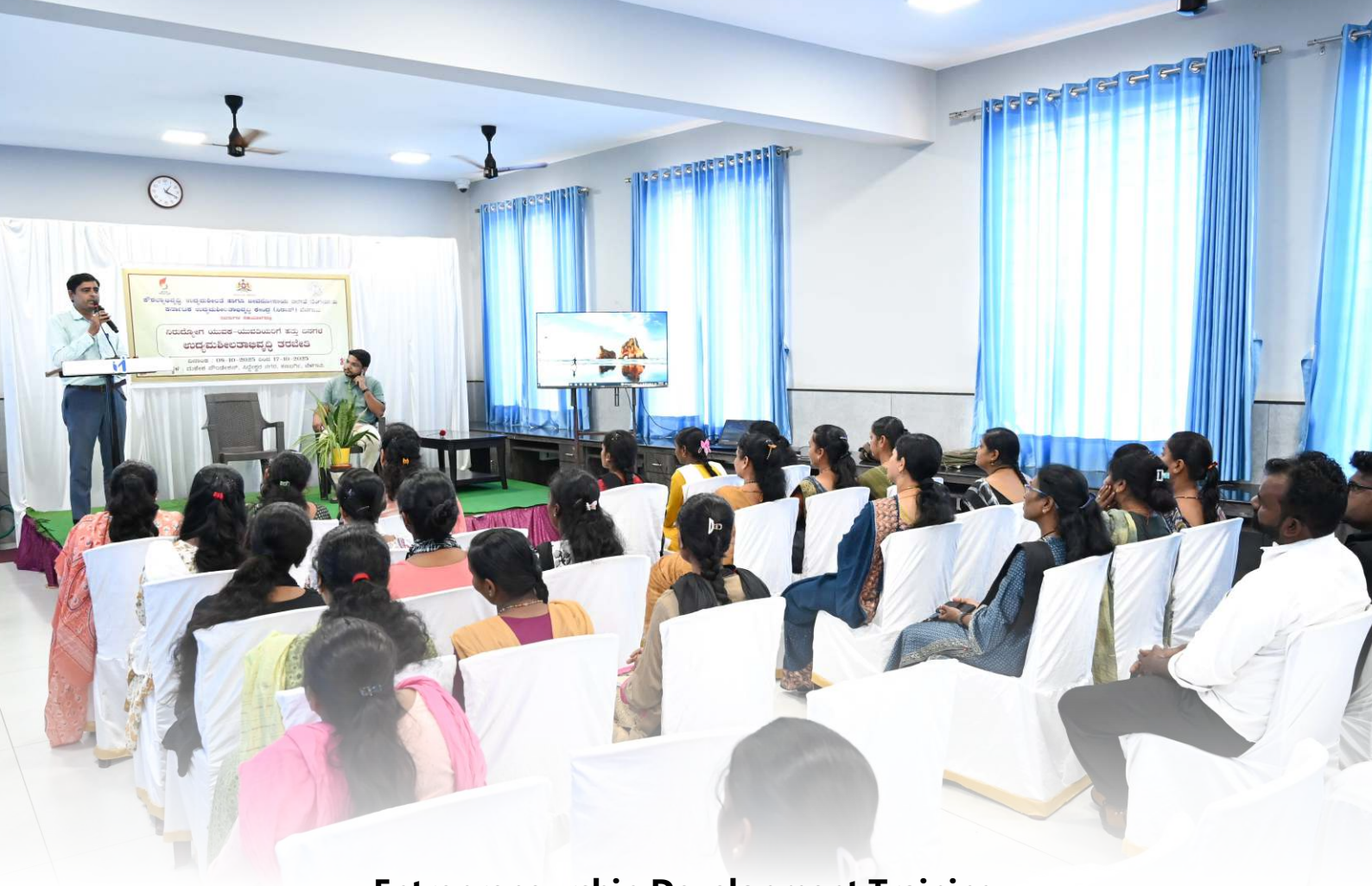
Entrepreneurship Development Training Empowers Youth at Mahesh Foundation.