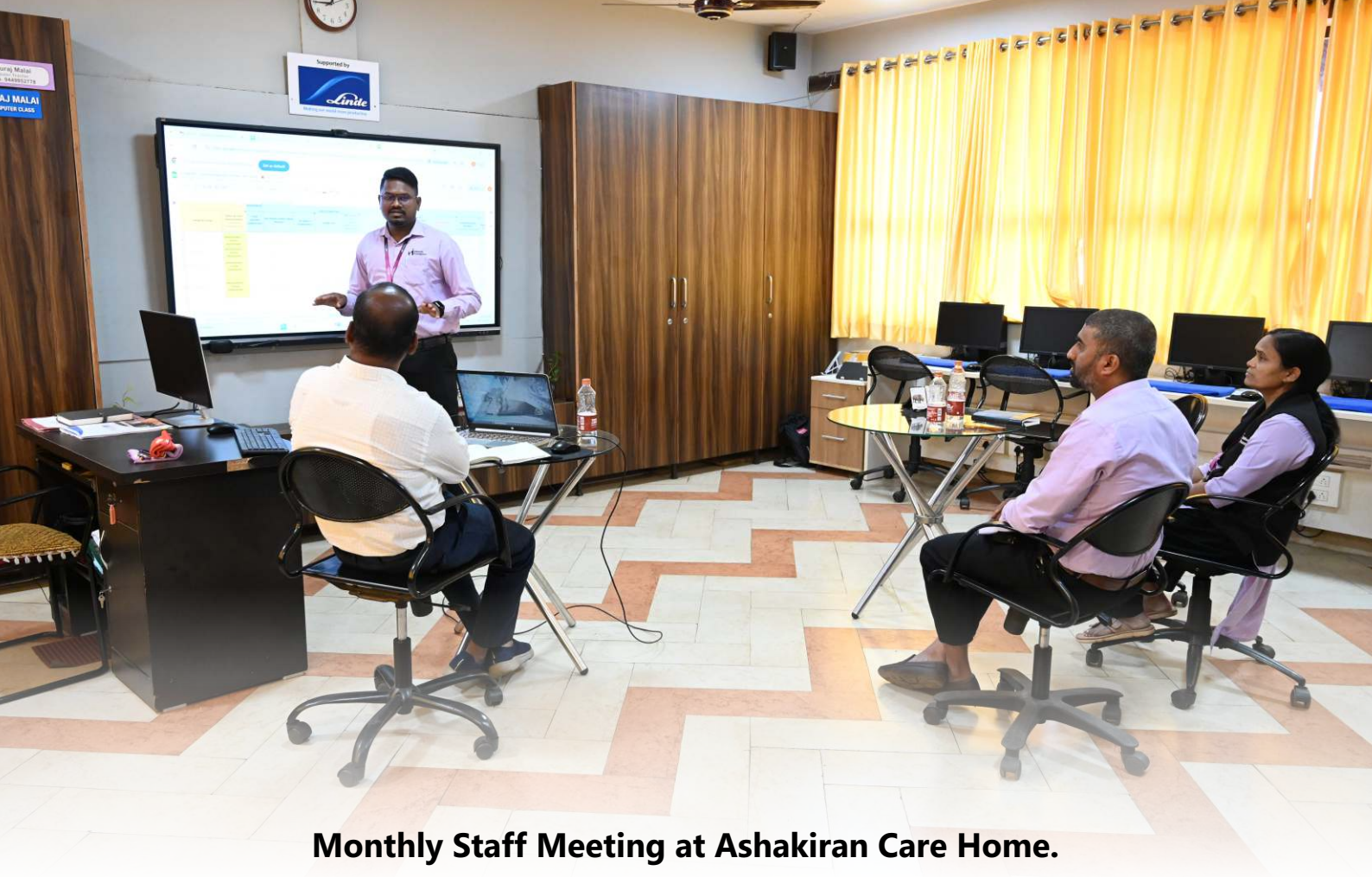
Monthly Staff Meeting at Ashakiran Care Home.