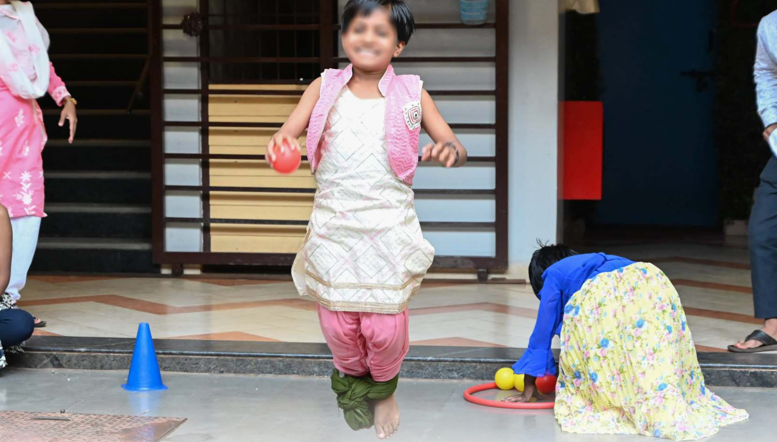
Toe-Jump Ball Collection Activity.