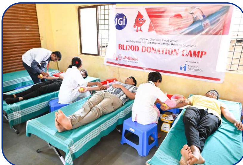
MyBlood & Jain Degree College Organize Successful Blood Donation Camp in Garlagunji Village