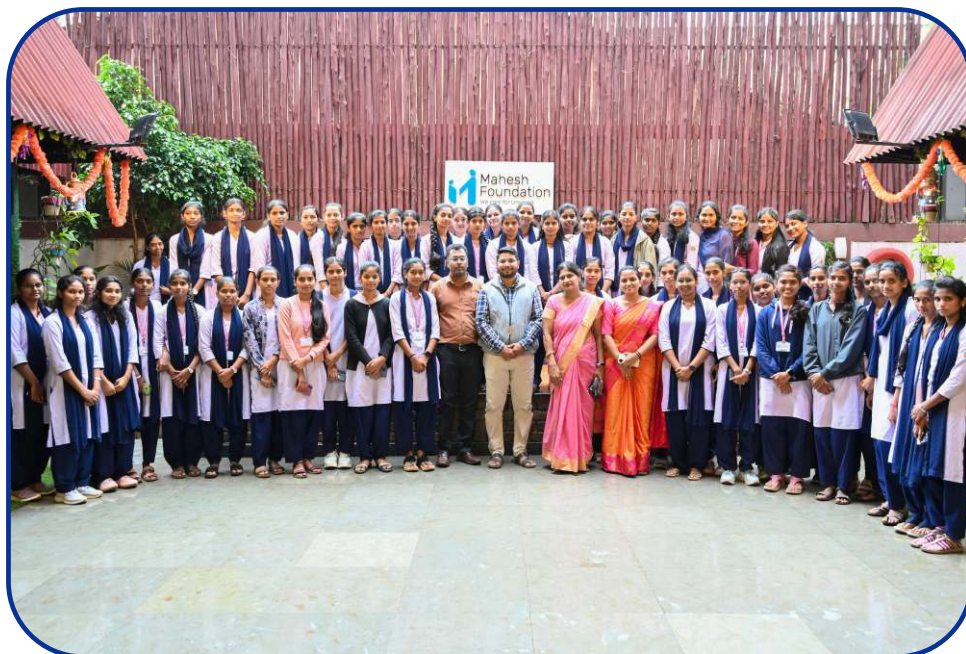
Lingaraj College Students Visit Mahesh Foundation for a Social Responsibility Initiative