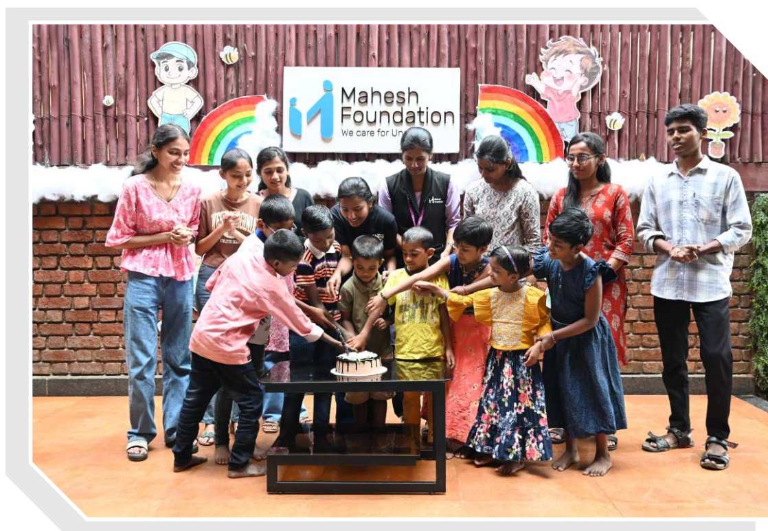
Children's Day Celebration at Ashakiran Care Home.