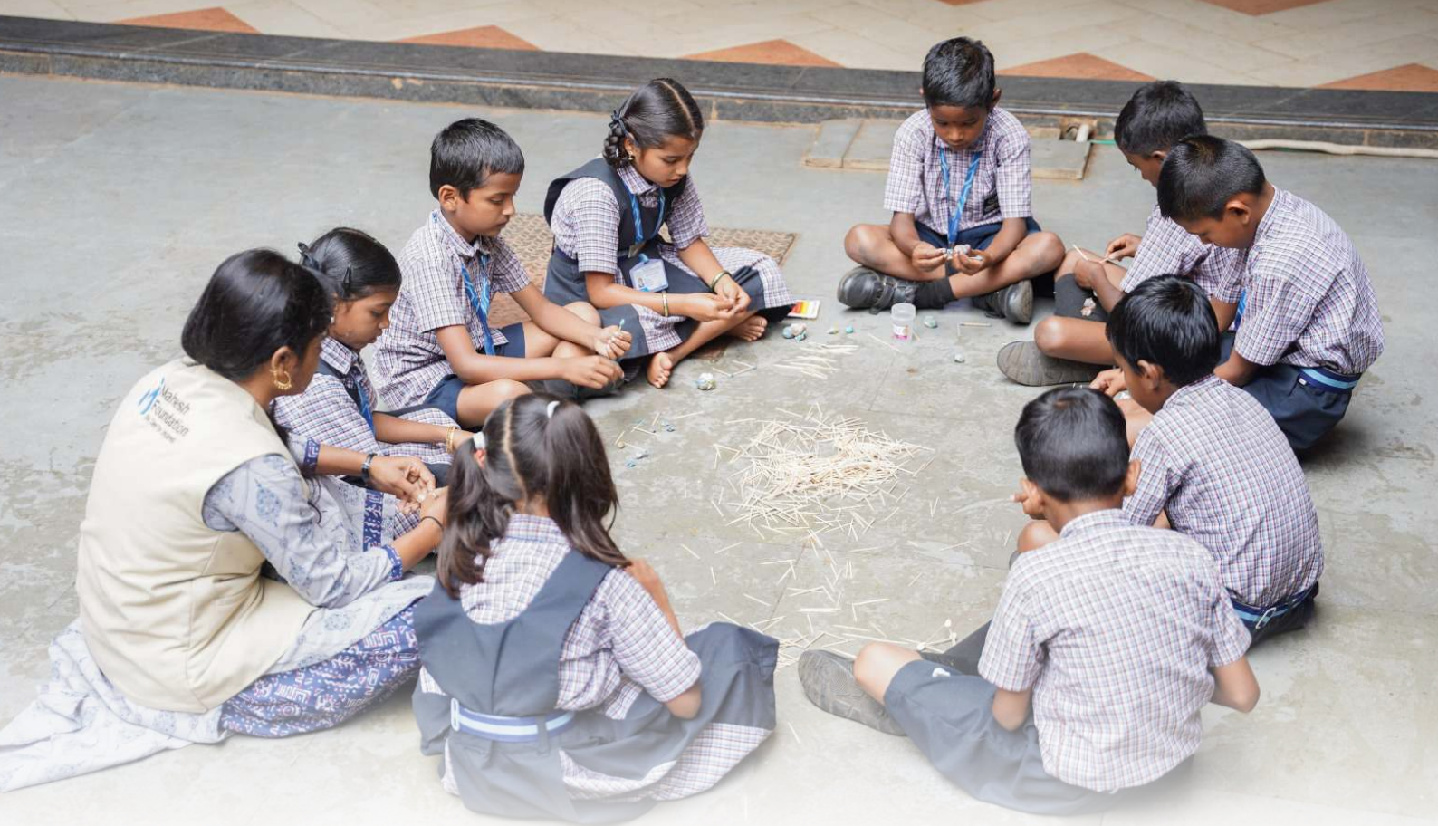
Utkarsha School Students Get Creative with the 'Making Figures' Activity