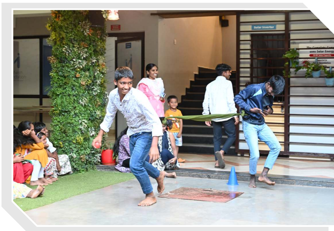
Strength Identification Activity for Skill Building.