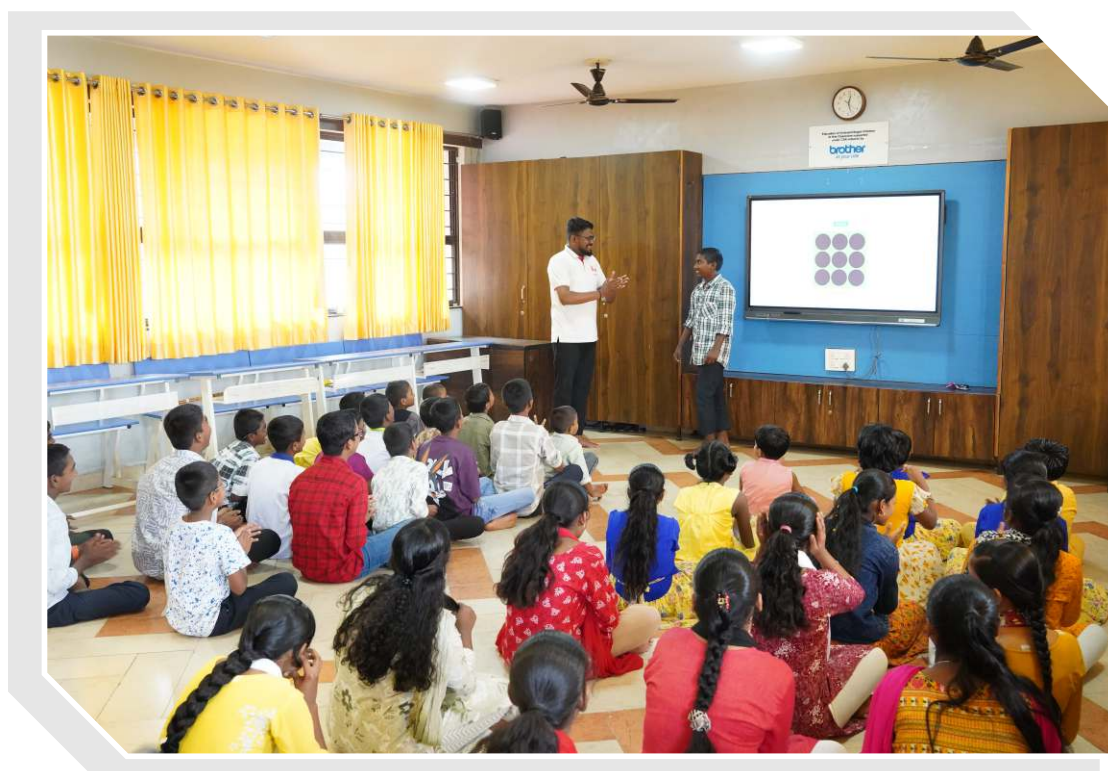
Quick Click Challenge Game.