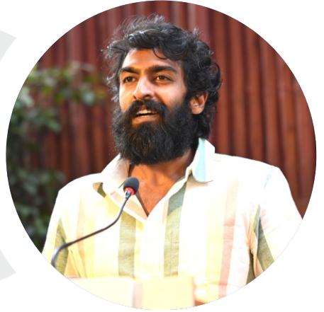
Mr. Vinay Rajkumar Actor, Kannada Film Industry

The work done by Mahesh Foundation is commendable and it was a pleasure to visit here. Mahesh Foundation is doing such a great work and I congratulate everyone. Their commitment to empowering children is truly inspiring. I believe their efforts will continue to make a positive impact for years to come. All children have some kind of talent.